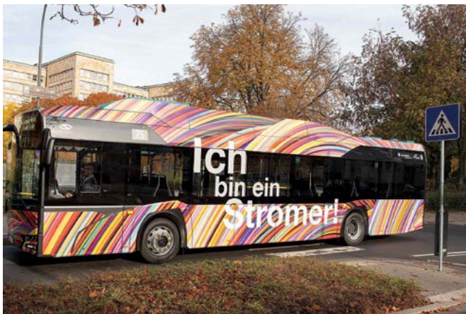
On route 75: the new E-buses.

On 9th December 2018 five new E-buses went into operation on route 75 in Frankfurt. The vehicles on the Ring Line, which connects Bockenheimer Warte, Uni-Campus Westend, Palmengarten and the Botanical Garden, have a battery capacity of 240 kWh which enables a range of 150 kilometres a day. The batteries can be recharged at night. Frankfurt's buses and lightrail trains are already making a considerable contribution to environment-friendly mobility in Germany's commuter capital.