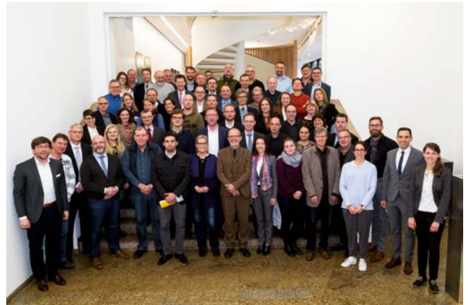
Closing event Ökoprofit Round 2017.