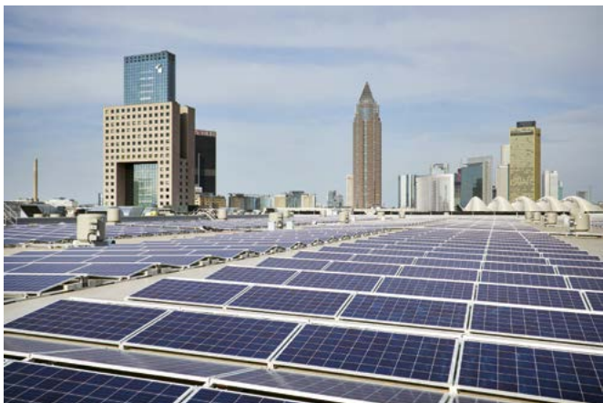
Energy harvesting for internal use – the new solar plant on the roof of exhibition Hall 12.

Frankfurt itself. The plant occupies an area of about 9,000 square meters and consists of 5,300 solar modules. In the future over 1 GWh of electricity for internal consumption will also be produced annually, which corresponds to the requirements of 241 households or about six percent of the exhibition grounds' current basic needs.