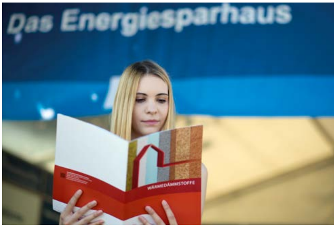
New brochures on climate protection and renewable energies. Source: Municipal Energy Agency. Photo: Salome Roessler