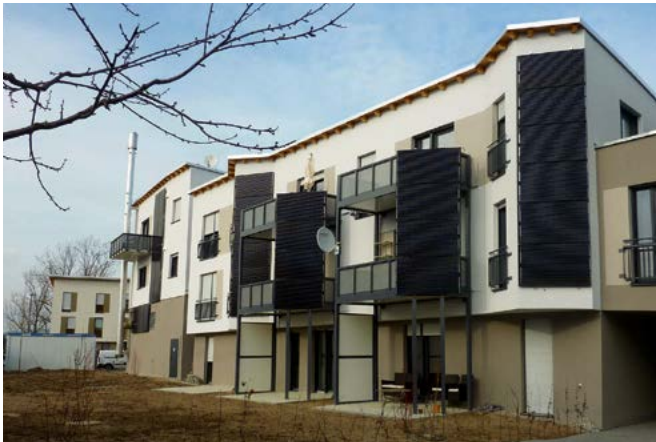
External West view of the „Energieautarkes Haus“.

The Energy-self-sufficient House Frankfurt is linked with the KEG's neighbouring Energy-Plus project Kamelienstraße, so the regeneratively-produced energy can be stored or used in the two buildings, depending on the storage capacities and requirements.