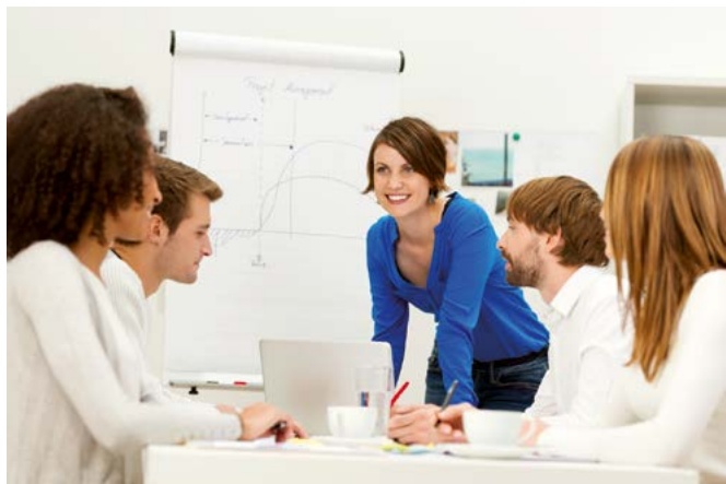
Experience exchange at local, nation and international level.