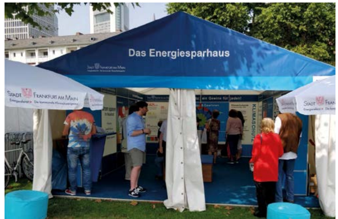
Lots of visitors to the "Save Energy" pavilion at the Museum Embankment Festival 2017.

In August 2017 the Municipal Energy Agency was again represented with its "Save Energy" pavilion at the Museum Embankment Festival. Many Festival visitors informed themselves at the stand about Frankfurt's climate protection targets, picked up brochures and flyers and took part in the Climate Quiz. As every year the lighting wall, where visitors can try out energy-saving LED lights, was extremely popular. People took a breather on the new seat upholstery under the big sun-umbrellas in front of the marquee and were delighted with the climate protection fans.