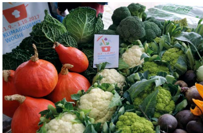
Climate Gourmet Week, an annual event.

In Frankfurt the exhibition was on display at the Land and Genuss Trade Fair, at the Climate Piazza in the Zoo and in the Central Library during the Climate Gourmet Week. In cooperation with Frankfurt Zoo and the Zoo School, in the week after the Climate Piazza the learning workshop "Climate Gourmet" was held with pupils from grades eight to eleven. With experiments and inter-active learning stations in the learning workshop the school classes learn how climate protection and nutrition are linked.