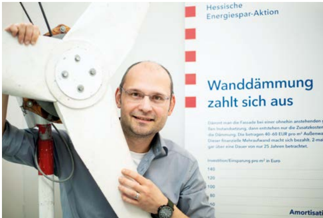
Energiepunkt; independent, grassroots counselling.