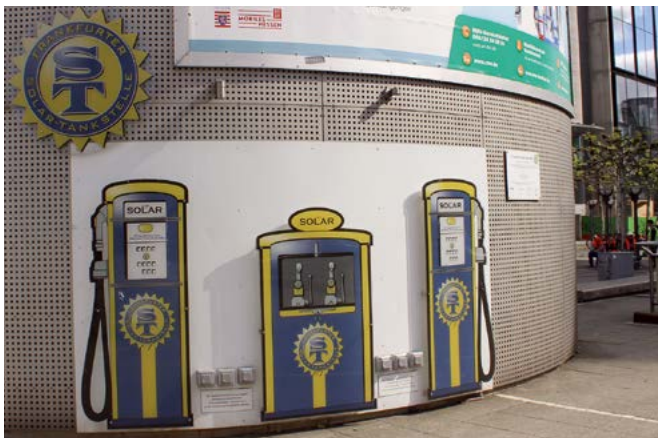
The solar filling station on Zeil was one stop on the Climate Protection tour of the city centre.

In summer 2017, to illustrate climate change in major cities, Frankfurt's Environment Department organised its first multi-day information event on the Roßmarkt in Frankfurt, one of the hottest places in the city. The "Climate Piazza" event invited residents to get information at the exhibition stands, to discuss with other people, to participate in talks, workshops and guided tours or simply chill in a summer lounge.