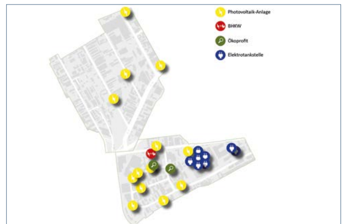
Existing climate protection activities in the sustainable commercial area. As of October 2018.

Until 31st December 2018 the project will also receive 150,000 euros from the "Experimental Housing and Urban Development" (ExWoSt) research programme which was initiated by the Federal Institute for Research on Building, Urban Affairs and Spatial Development and the Federal Ministry of the Interior, Building and Community.