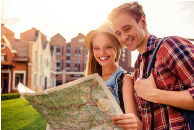
The climate protection city map documents Frankfurt's climate protection projects online.

porated into the Mobility section and currently there are about 4,300 climate protection projects listed in the Frankfurt city area.