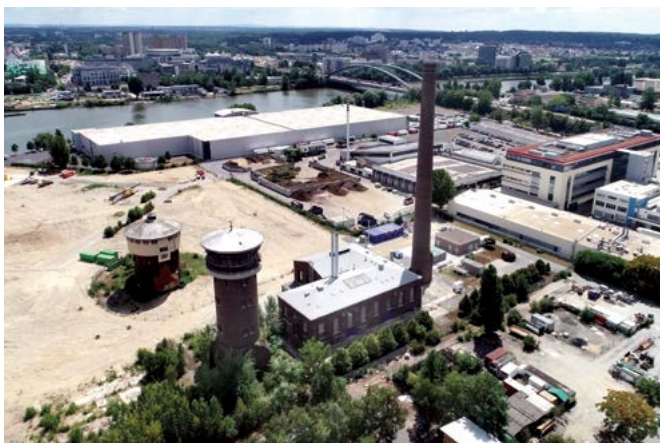
Climate-neutral biogas from bio-waste.