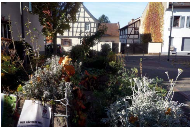
The Kirchplatz Garden in Ginnheim.

At the end of August 2016 Frankfurt’s Municipal Energy Agency called on citizens involved in clubs, associations and foundations to apply for funding as part of their initiatives with neighbourhood projects for climate protection. The aim was to make financial sponsoring available for project proposals in the framework of the BMU, the Federal Ministry for the Environment, Nature Conservation and Nuclear Safety’s call for funding “Shortcuts to combatting climate change”. At the end of 2017 the three winning projects in the Frankfurt competition received BMU funding approval for the projects they submitted. This meant that, from the end of 2017/ start of 2018, many projects could start their work, such as the meeting point in the community garden “Tortuga Eschersheim”, the “Climate Workshop Ginnheim” and the “Heddernheim im Wandel – Starke Nachbarschaften für Klimaschutz und Lebensqualität” (The changing face of Heddernheim – Strong neighbourhoods for climate protection and quality of life).