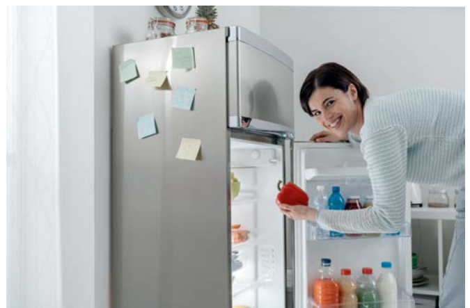
An energy-efficient refrigerator saves energy and costs.

In addition to the free consulting services for low-income households the Caritasverband Frankfurt e.V., commissioned by the Municipal Energy Agency, also offers a refrigerator exchange programme. Vouchers are issued to support low-income households financially in buying new, energy-efficient refrigerators. 226 households received the bonus in the period 01/2017-10/2018. The exchange programme is thus an effective instrument for CO 2 savings in the household.