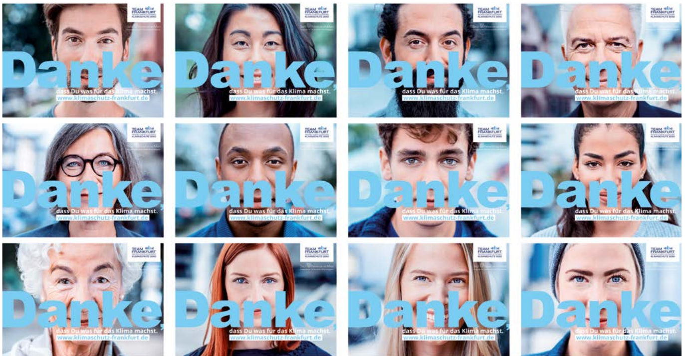
Thank you motifs for Frankfurt.

„Thank you for protecting the climate” is the slogan which the City of Frankfurt am Main presented in October 2017 to draw attention to climate protection and motivate people to take action. A “Thank You” is open, pleasant and appreciative. It makes people curious and attracts them to the Website www.klimaschutz-frankfurt.de . The aim of the new communication campaign for climate protection in Frankfurt am Main is to make people aware of the issue, then turn to the website and find out how easy it is to make a small personal contribution to climate protection. The new contact point in the Internet offers a wide spectrum of information, from blogposts to people actively involved in climate protection in Frankfurt am Main, to tips for target groups to current events – here you can find real-time information on climate protection in the Main metropolis.