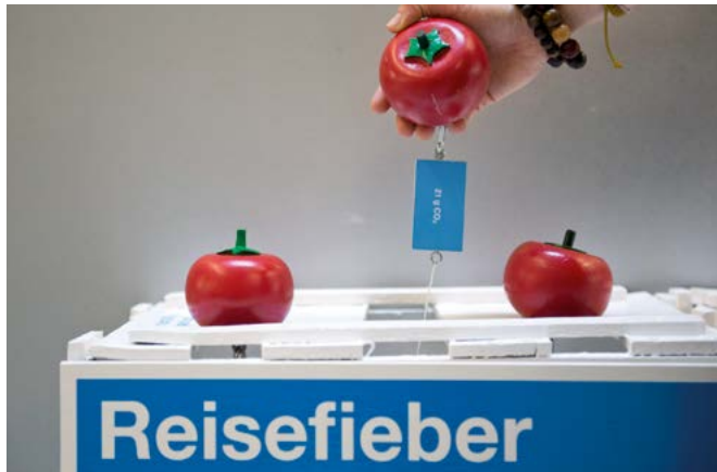
The learning workshop Climate Gourmet shows pupils the links between Nutrition and Climate Protection.

The Municipal Energy Agency supports the learning workshops with expertise and financially. In 2018 learning workshops were given in 20 schools to all the pupils of one year, in all over 2500 pupils, whereby the demand on the part of the schools greatly exceeded the budget available for implementation.