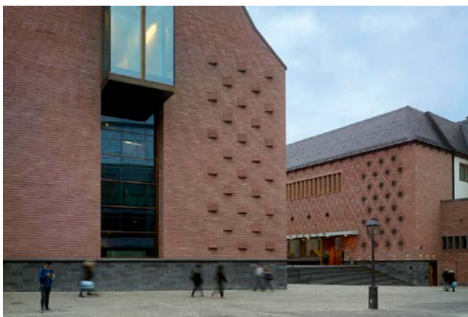
West view of the Historisches Museum.

Although the Historisches Museum on the Römerberg in Frankfurt is undoubtedly one of the most important historical institutions in Hesse, the former building in the “concrete brutalist” style of the late 60’s, in which the Museum had been housed since 1972, became increasingly unpopular among the citizens, as it gave the visitor no indication of the historical treasures inside. From today’s museum-didactic standpoint the museum had serious functional and structural deficiencies. Above all, the architecture of the building found less and less acceptance among many citizens. As a result the building was completely rebuilt.