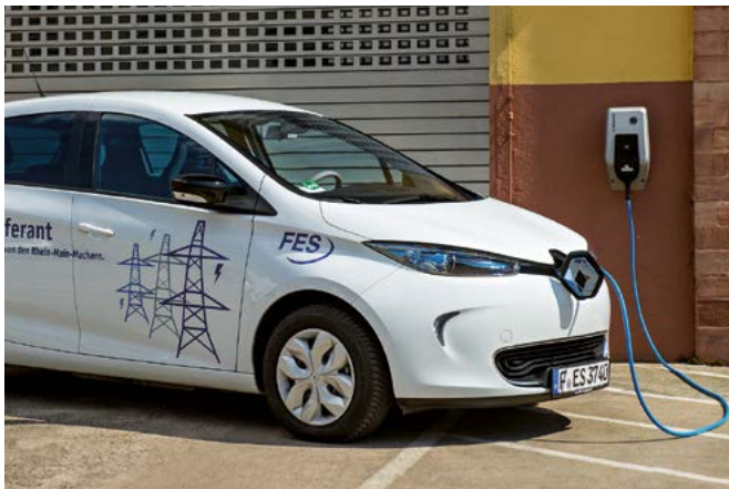
Eight new charging stations for E-vehicles.

In 2017/18 the FES Frankfurter Entsorgungs und Service GmbH installed two new photovoltaic systems on the roofs of their properties. The FES now operates eight of its own PV plants in Frankfurt and one in Mainz-Kastel and areas of the solar park in Dreieich-Buchsschlag. In 2018 the renewably generated electricity produced accounted for 96.5 percent of the FES-Group's requirements.