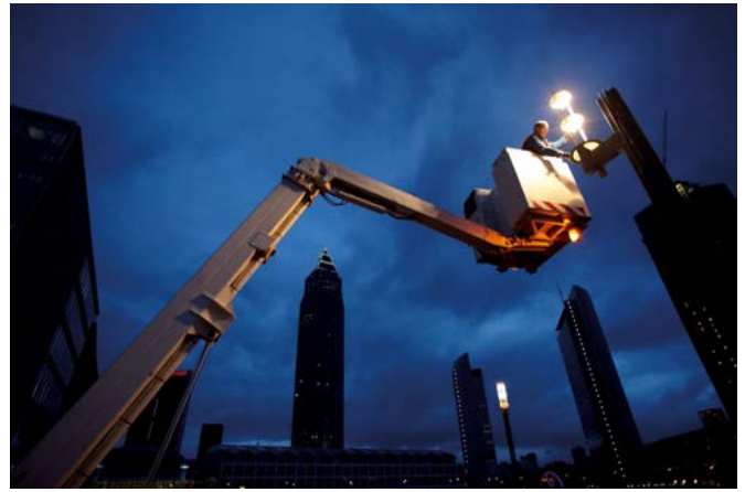
Work on the street lighting.

The luminaires along the Wallanlagen use Light-On-Demand technology, which allows intelligent dimming of the lighting and which, in future, will provide light as needed since it is also possible with these luminaires to adjust lighting times and intensity. The idea is, besides the already efficient LED technology, to generate more potential savings and ensure greater security for pedestrians with more homogenous light distribution.