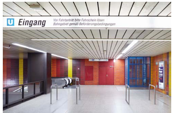
Höhenstraße U-Bahn station with new LED lighting.

This was followed in 2018 by the lighting in the U-Bahn stations Dom/Römer and Leipziger Straße and the tunnels between Konstablerwache and Seckbacher Landstraße. This renewal process is to be continued on an ongoing basis. The much more efficient LED luminaires have led to significant energy savings of over 50 percent below ground and up to 90 percent above ground, despite the higher luminosity. Together with the updated lighting at several tram stops consumption fell by about 350,000 kilowatt hours (kWh) annually.