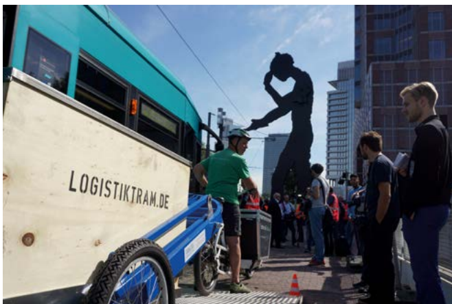
The idea of a logistics tram is highly acclaimed in Frankfurt am Main.

In partnership, the winners of the "Climate Protection Ideas Competition" (riemanndesign and Sachen auf Rädern), the City of Frankfurt, the House of Logistics & Mobility (HOLM) GmbH, the Frankfurt University of Applied Sciences (UAS), the IHK Frankfurt, the Climate Alliance and the VGF in summer 2018 developed the concept for the pilot. Hermes Germany GmbH, the dispatch service provider, was also included in the project.