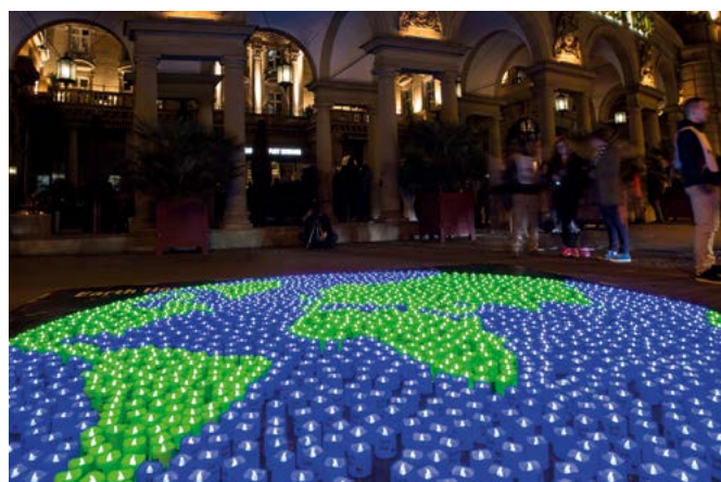
Lights out for climate protection.

In 2017 and 2018 the City of Frankfurt participated again under the motto "Gemeinsam Frankfurt bewegen" (Together we move Frankfurt) in the worldwide Earth Hour. Every year the Earth Hour, which was launched by the WWF, sends a clear global signal for climate protection. During the symbolic hour in March 2017 and 2018 millions of people around the globe switched off their lights on the same evening. From New York to Nairobi, from Paris to Panama over 7,000 cities in 184 countries take part every year. The Frankfurt Municipal Energy Agency in these two years ensured a blackout of the Skyline and appealed to companies to switch off the lights in their buildings for one hour.