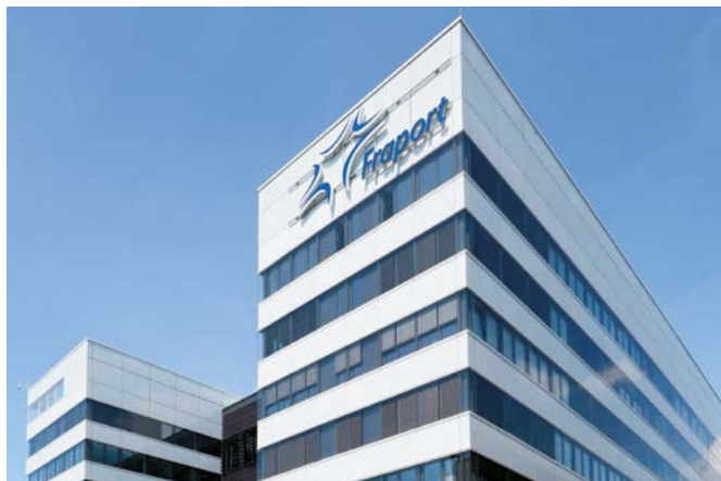
Fraport: corporate headquarters