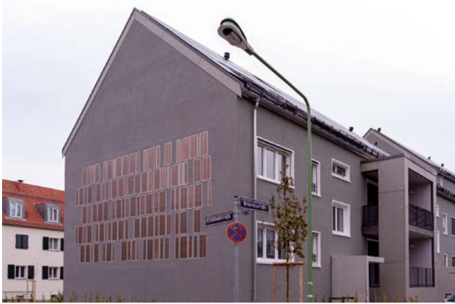
Organic photovoltaics on a facade.

and air source heat pumps, more climate-neutral energy is generated than the residents consume. This project proved that highest standards in energy efficiency can be applied, not only in new buildings, but also in the refurbishment of existing flats from the 1950's. The experience gained could be used nationwide for renovating thousands of similar types of houses.