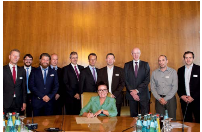
Signing the LEEN contract in 2016.

The CO 2 savings already achieved amount to over 19,000 tonnes a year which corresponds to the annual CO 2 storage capacity of 1,500-1,900 hectares of mixed forest in Germany.